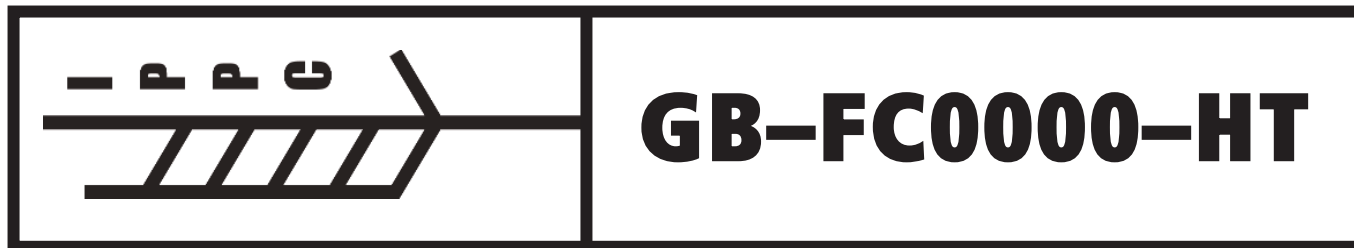
| Example 5