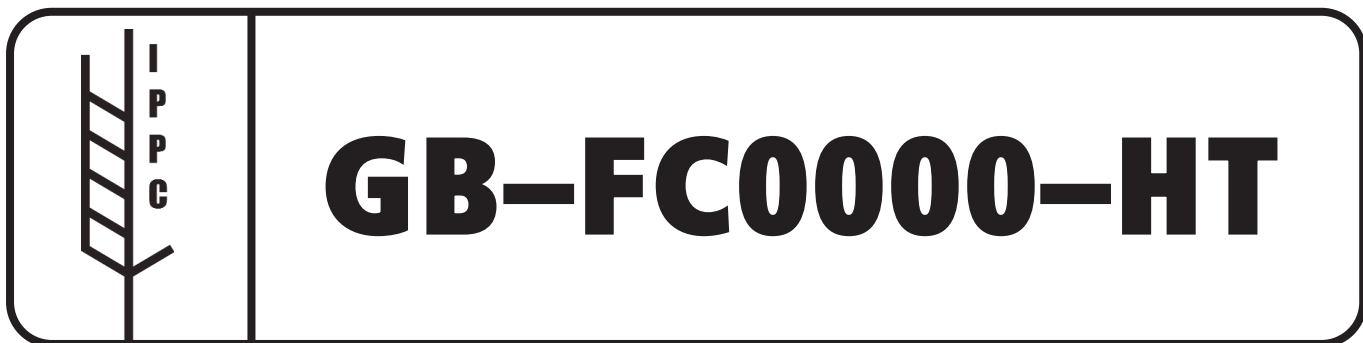
| Example 3 - version 2