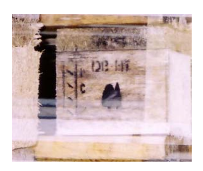
Forestry Commission Plant Health Service April 2005